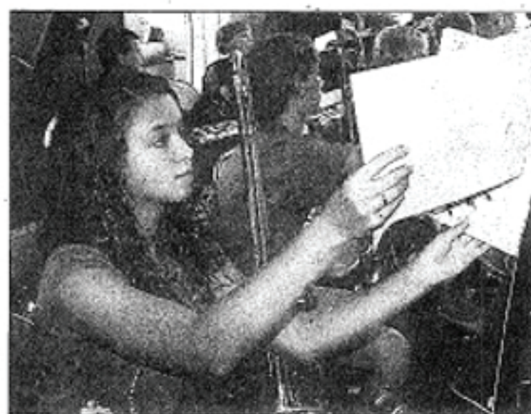
Students practice during Harper School summer camp.